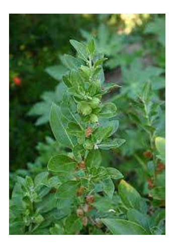
Withania somnifera (Ashwagandha)

Ashwagandha